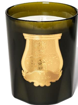
The Great Candle

Weight : 800 g Size : H: 16 cm, Ø max : 13,5 cm Burning Time : 110 to 120 h