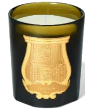
The Classic Candle

Weight : 70 g Size : H: 6,4 cm, Ø max : 6,7 cm Burning Time : 18 to 20 h