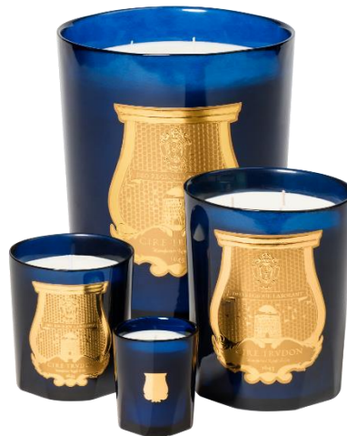
Scented Candle Family Belles Matières