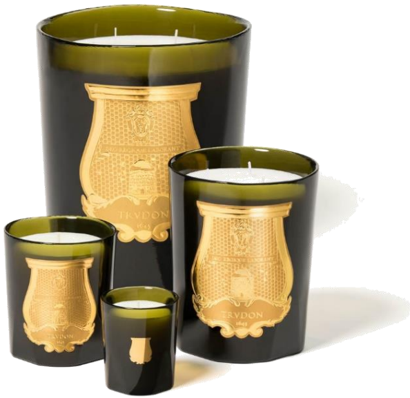
Classic Scented Candle Collection