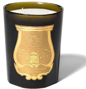
The Intermezzo candle

Weight : 270 g Size : H:10,5 cm, Ø max : 9 cm Burning Time : 55 to 65 h