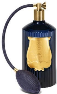
Roomspray Belles Matières

The Duke of Tuscany introduced jasmine to India around 1690, and since then its fresh or dried flowers, native to Arabia, have nourished Indian culture in its myths and daily rituals. Here, Jasminum sambac is used to perfume tea or tied in garlands; there, on the outskirts of temples, it becomes an offering.