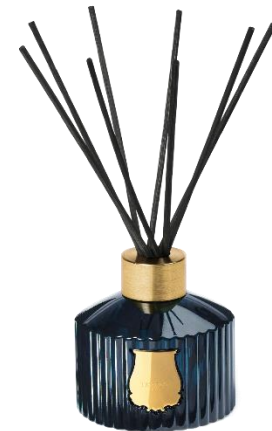
Diffuser Belles Matières