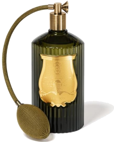
The Room spray - 375 ml

Daily usage duration of approximately 1 year